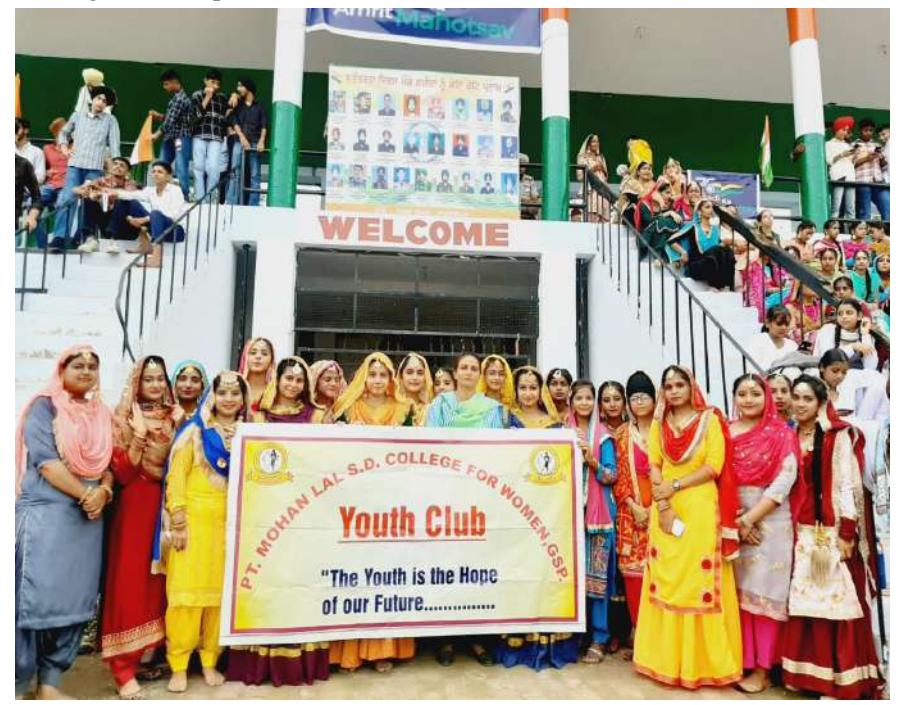
Giddha on the occasion of Independence Day

Students of our college performed Giddha on the occasion of Independence Day at Government College, Gurdaspur.