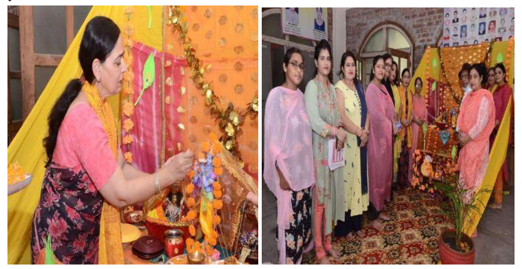
Janmashtami, the day of birth of Lord Krishna

Sanatan Dharam Sabha Committee and Hindi department of the college celebrated Janmashtami, the day of birth of Lord Krishna, with a lot of excitement and gaiety in the campus. The program began with seeking blessings from the almighty. Aarti and bhajan were sung by the students and the staff.