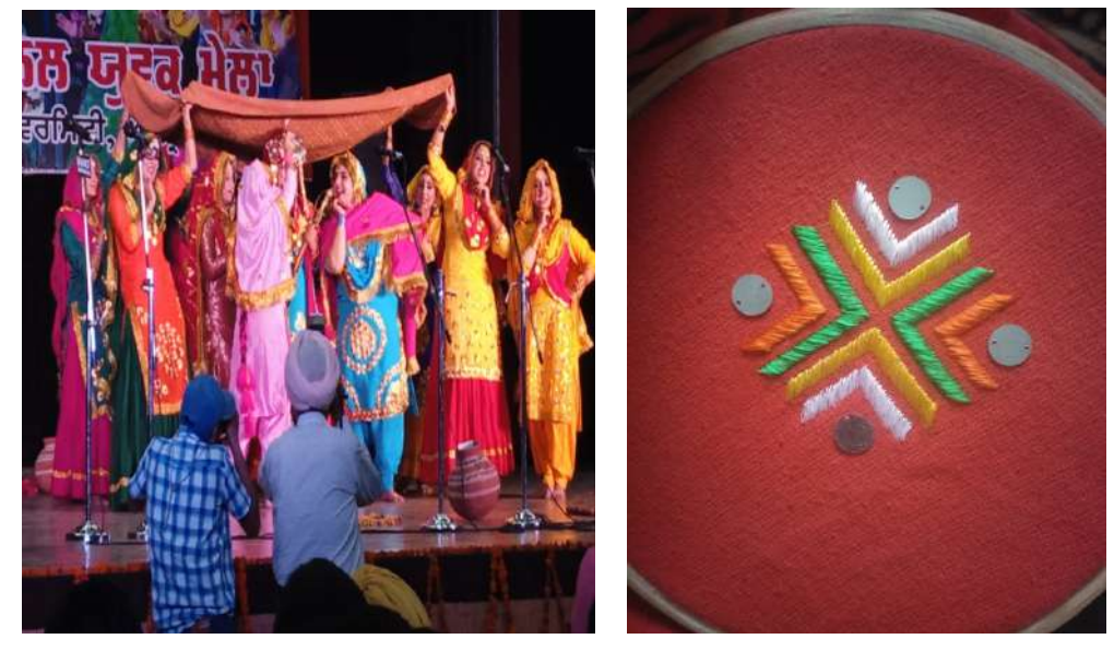
Giddha in Youth festival, GNDU Amritsar

Our College students performed Giddha in Youth festival GNDU, Amritsar and bagged 3<sup>rd</sup> position. In Phulkari our student Ramanpreet Kaur got 2<sup>nd</sup> position.