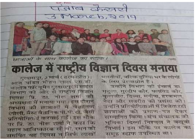
NATIONAL SCIENCE DAY

The Science Department of the college celebrated National Science Day. Contests like:- Scientific Rangoli on Save Earth, Doppler's Effect, Excretory System, Ozone Layer etc; Scientific Drama on superstitions and powerpoint presentations on latest inventions in Physics, Chemistry, Botany & Zoology etc. were organized.