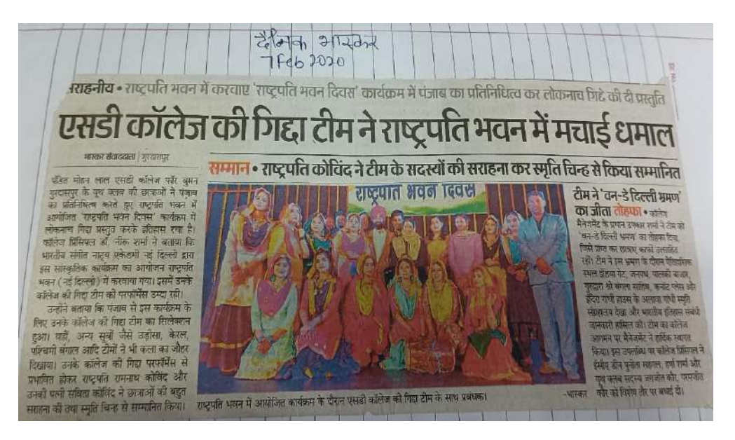
FOLK DANCE AT RASHTRAPATI BHAVAN, NEW DELHI

On 3<sup>rd</sup> Feb, 2020, our giddha team represented the State of Punjab by performing folk dance at Rashtrapati Bhavan, New Delhi.