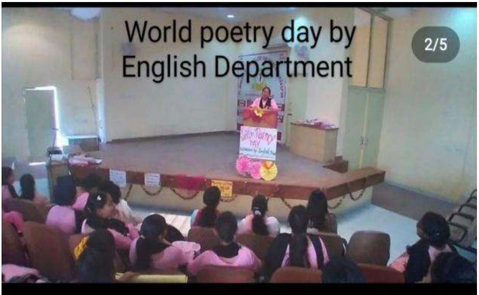
World Poetry Day

The English Department celebrated World Poetry Day. World Poetry Day is the occasion to honor poets, revive oral traditions of poetry recitals and promote the reading, writing and teaching of poetry.