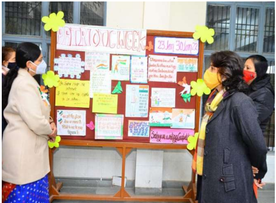
Slogan writing competition on 'Patriotism'.

Economics and Patriotic club of the college organized an online slogan writing competition on 'Patriotism'.