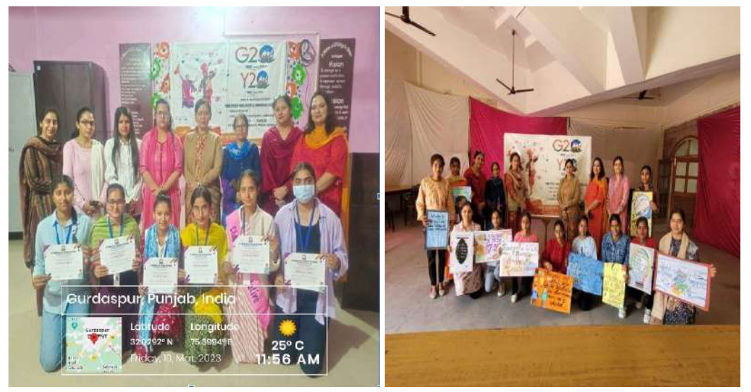
Youth 20 Shikhar Sammelan

College organized Slogan writing, Poster making, Declamation, Quiz contests in the first week of March under the G-20 Bharat 2023 India, Youth 20 Shikhar Sammelan Consultation: Theme Future of work: Industry 4.0, innovation and 21st century skills' as per instructions by GNDU, Amritsar.