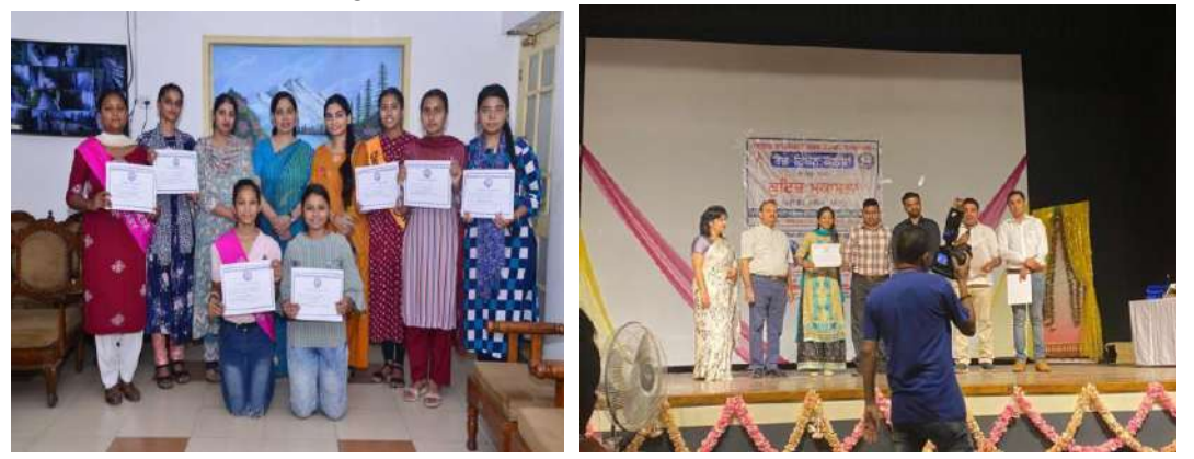
Programme organized by Asst. Director Youth Services, Gurdaspur and Red Ribbon Club at Shanti Devi Arya Mahila college, Dinanagar.

9 students of the Red Ribbon Club participated in a programme organized by Asst. Director Youth Services, Gurdaspur and Red Ribbon Club at Shanti Devi Arya Mahila college, Dinanagar. Students participated in different events like Quiz, EssayWriting Competition, Declamation, Poster Making etc.