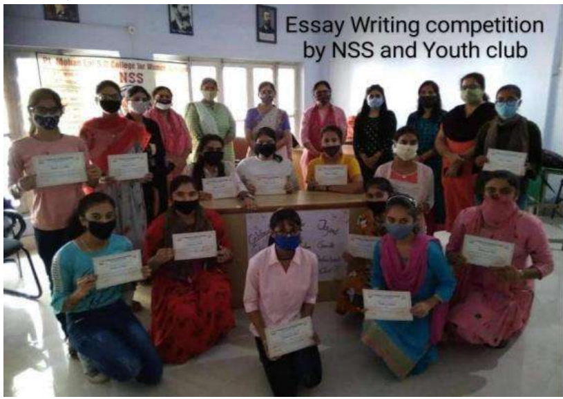
National Youth festival

The Punjabi department organized an essay writing competition on 'National Youth festival' in which 15 students participated enthusiastically out of which 9 best essays were sent to GNDU, Amritsar.