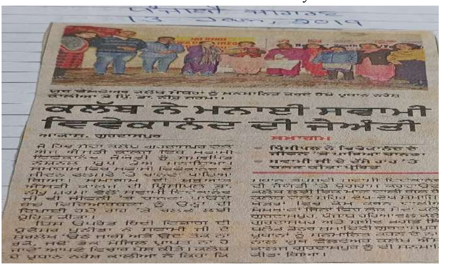
NATIONAL YOUTH DAY

'National Youth Day' was celebrated by the Youth Welfare Club of the college to commemorate the Birth anniversary of Swami Vivekananda.