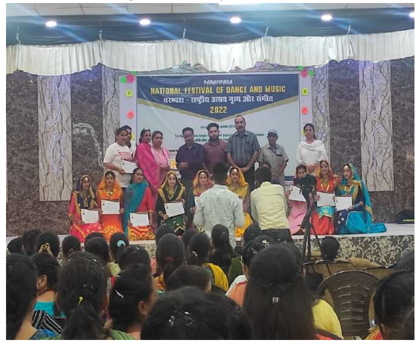
Giddha at National Festival of dance and music

Our college students participated in Giddha at the National Festival of dance and music organized by Shabnam Youth and Sports Club, Punjab.