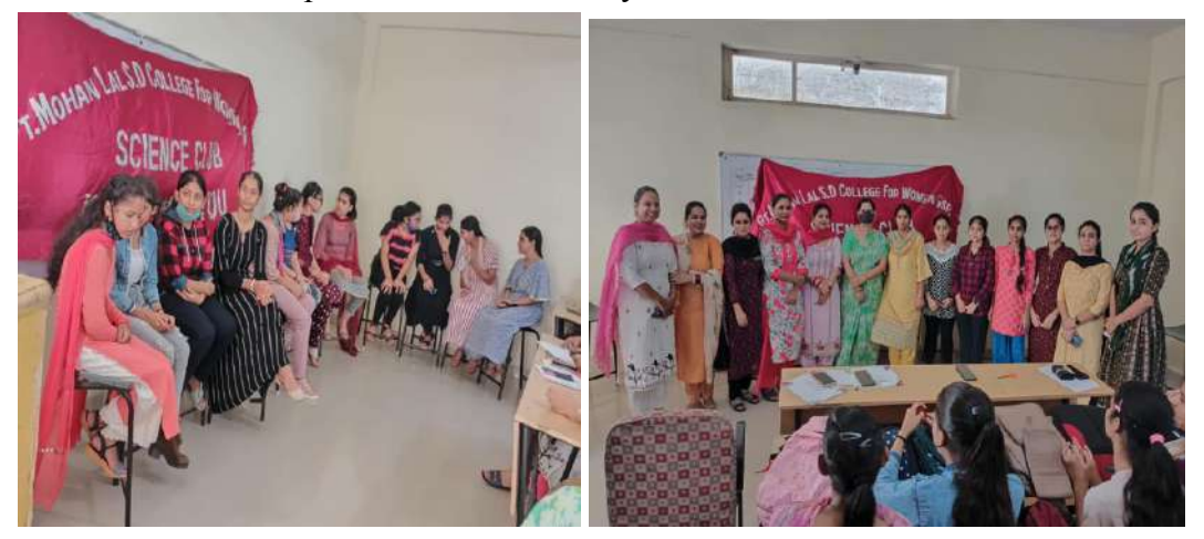
World Ozone Day

College organized a Quiz competition on 'World Ozone Day'-2021. Students as well as teachers took part in this event with all zeal. The objective was to raise awareness about the issue of depletion of the ozone layer.