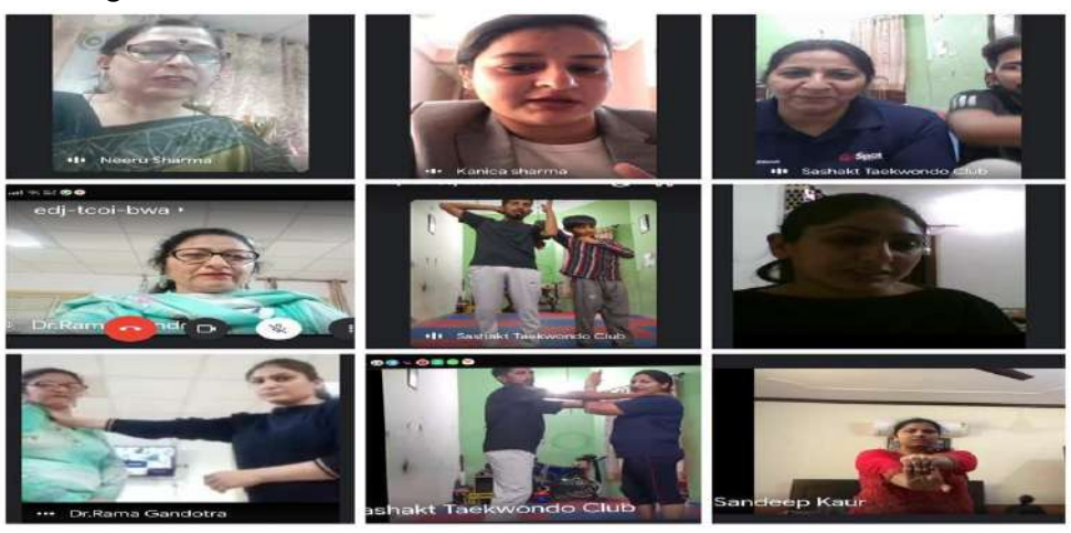
Online Seminar & Workshop on Self Defence

Online Seminar & Workshop on Self Defence was organized in line with the celebration of International Women's Day by the Sociology Department and Alumni Association of the college.