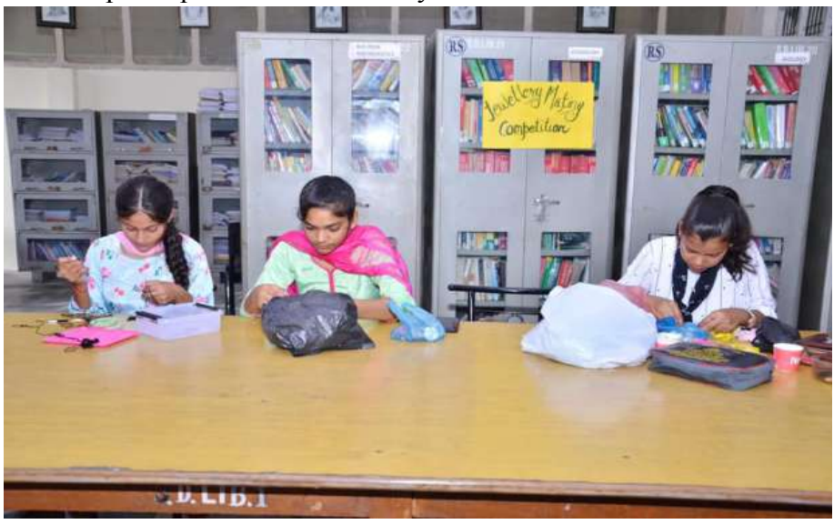
Handmade jewellery competition

The FD department organized a Hand Handmade jewellery competition in which they made ornaments through paper quilling, metals and other materials. The students participated enthusiastically.