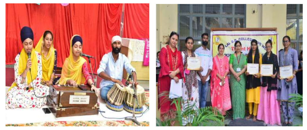
Talent hunt-Khoj Ek Prayas

A two-day programme "Talent hunt-Khoj Ek Prayas" was organized. The aim of this programme was to channelize energy, make individuals more responsible, relax their minds, tapping the potential of the students and to improve their confidence level. The program started with full enthusiasm in which fine arts activities such as poster making, cartooning, collage making, and landscape painting and Home Science activities like Rangoli were organized. The FD and Cosmetology department organized Mehndi, Nail Art, Photography. Apart from this, theater items such as Solo Dance, Folk Song, Group, Shabad, Bhajan etc. were organized. In Literary events, Poetry, Quiz, elocution, extempore etc. competitions were held. Winners were awarded with certificates.