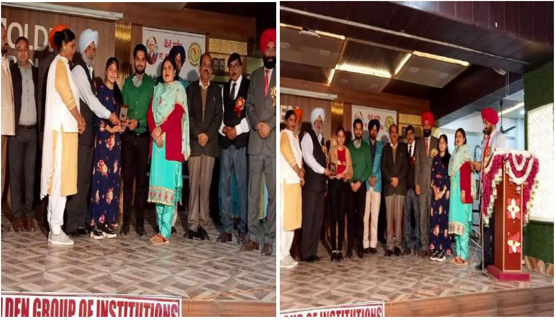
Sabyacharakb Mela by Natali Rangmanch

22. 16 Nov, 2021 Sabyacharakb Mela by Natali Rangmanch