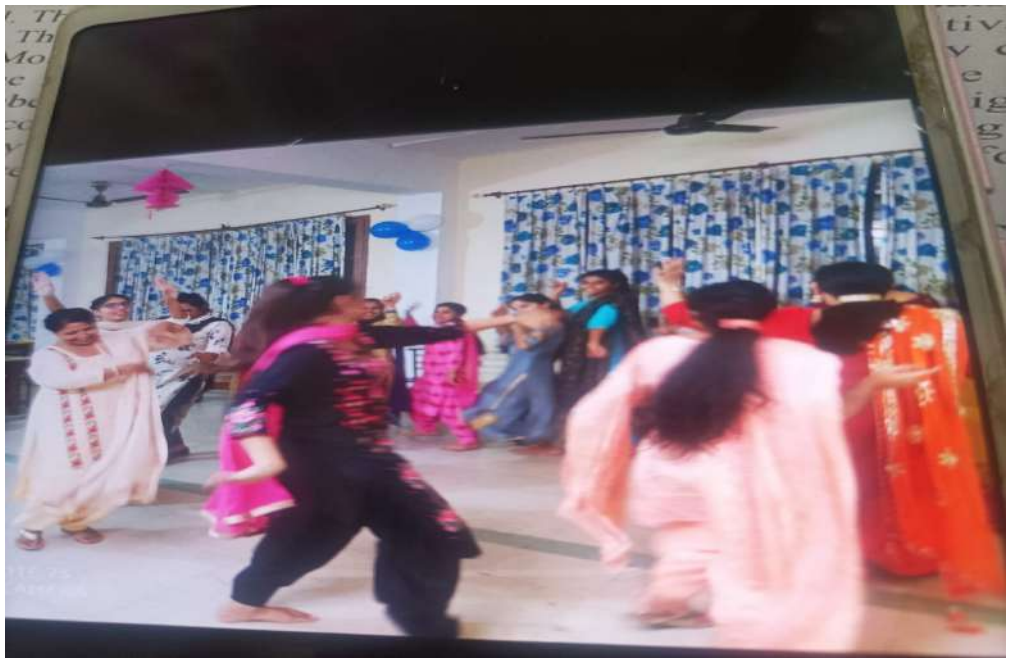
Diwali night in hostel

A memorable Diwali Night was celebrated in Girls Hostel on 5 th November, 2018. A special dinner for students was arranged by the college Principal. Games and activities were organized for students.