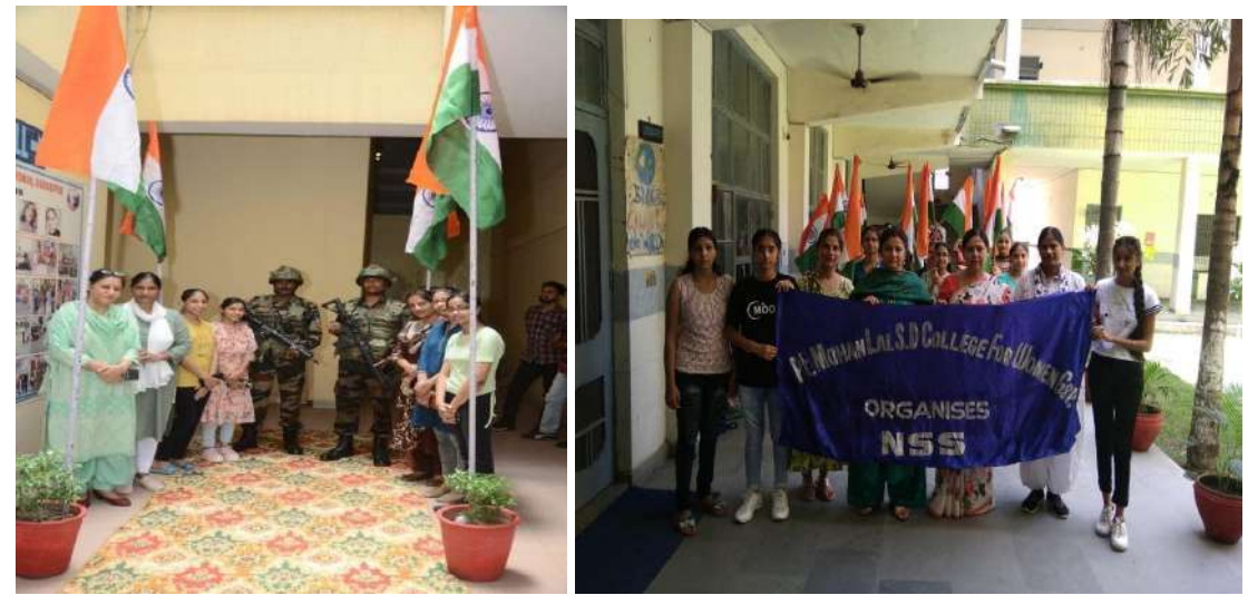
75th anniversary celebrations of India's Independence

The college organized a series of events on 75th anniversary celebrations of India's Independence with great enthusiasm. Various activities in collaborations with different departments Tiranga March, Hara Bhara Bharat, Nukkad Natak etc. were organized.