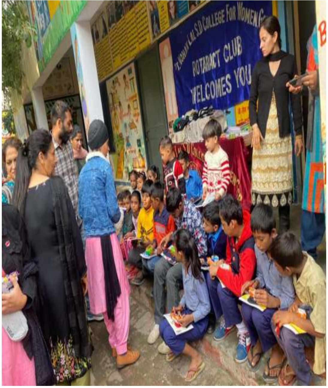
Sharing Happiness with Others

Central Association of college, under the project 'Sharing Happiness with Others' distributed many useful things like clothes, books etc. to the needy students.