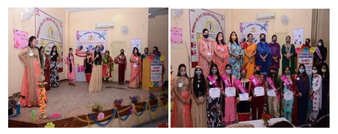
Talent hunt-Khoj Ek Prayas

Pt. Mohan Lal S.D.College For Women, Gurdaspur has completed 25 years of its journey. To mark this gala event,"Talent hunt-Khoj Ek Prayas' ' was organized. The program started with full enthusiasm in which sports events were organized and activities such as cartooning, newspaper craft, mehndi, painting competitions, folk dance, group dance ,solo song and many literary items were also organized under the supervision of various teacher incharges.