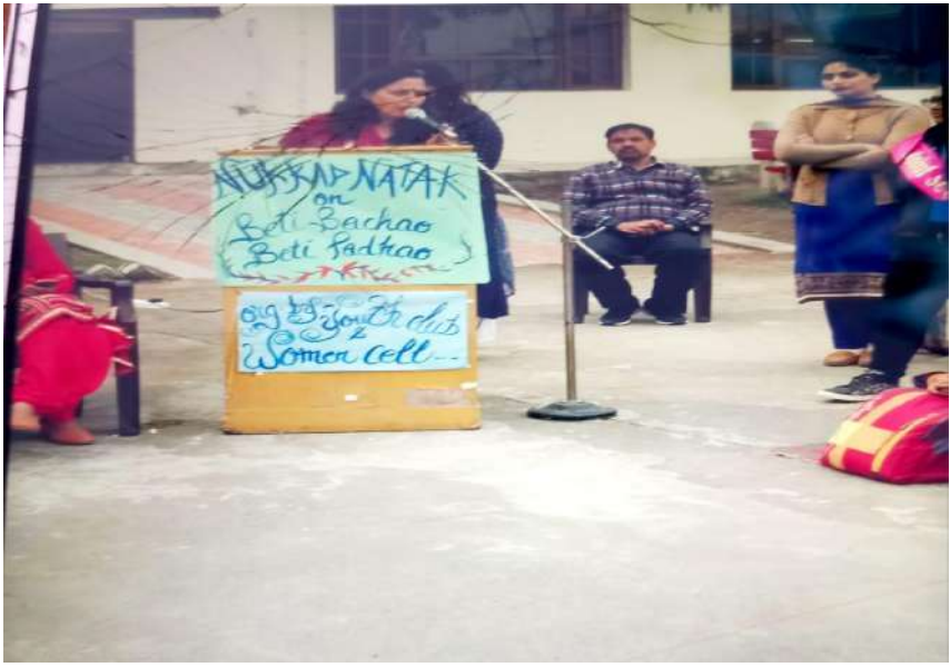
Street Show on Women's day celebration

Women's Day was celebrated by the Women Cell & Youth Club of the college, in which a Street Show was performed by the proponents of Bhagat Namdev ji Theatre Society (Ghuman) on the theme of 'Beti Bachao Beti Padhao'.