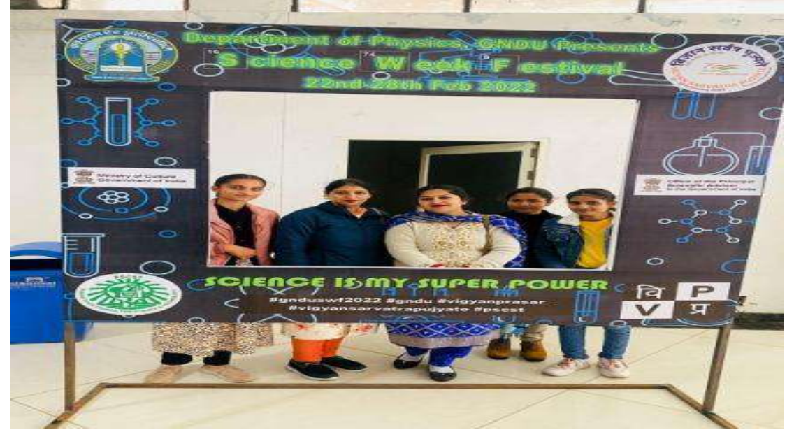
Science festival at GNDU, Amritsar.

Students of the Science Department attended a science festival at GNDU, Amritsar in which competitions based on themes related to science and technology were held to develop a healthy scientific rational temperament in the younger generation.