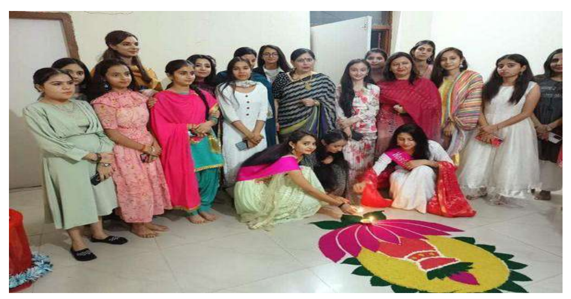
Diwali Night in the Women hostel

The hostellers along with hostel committee incharges and College Principal celebrated Diwali Night in the Women hostel. The College Principal along with students and incharges lit candles & diyas.