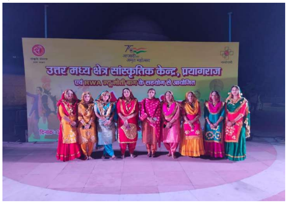
Uttar Madhya Kshetra Sanskritik Centre Prayagraj

Gidha performance by College Students at Uttar Madhya Kshetra Sanskritik Centre Prayagraj, New Delhi.