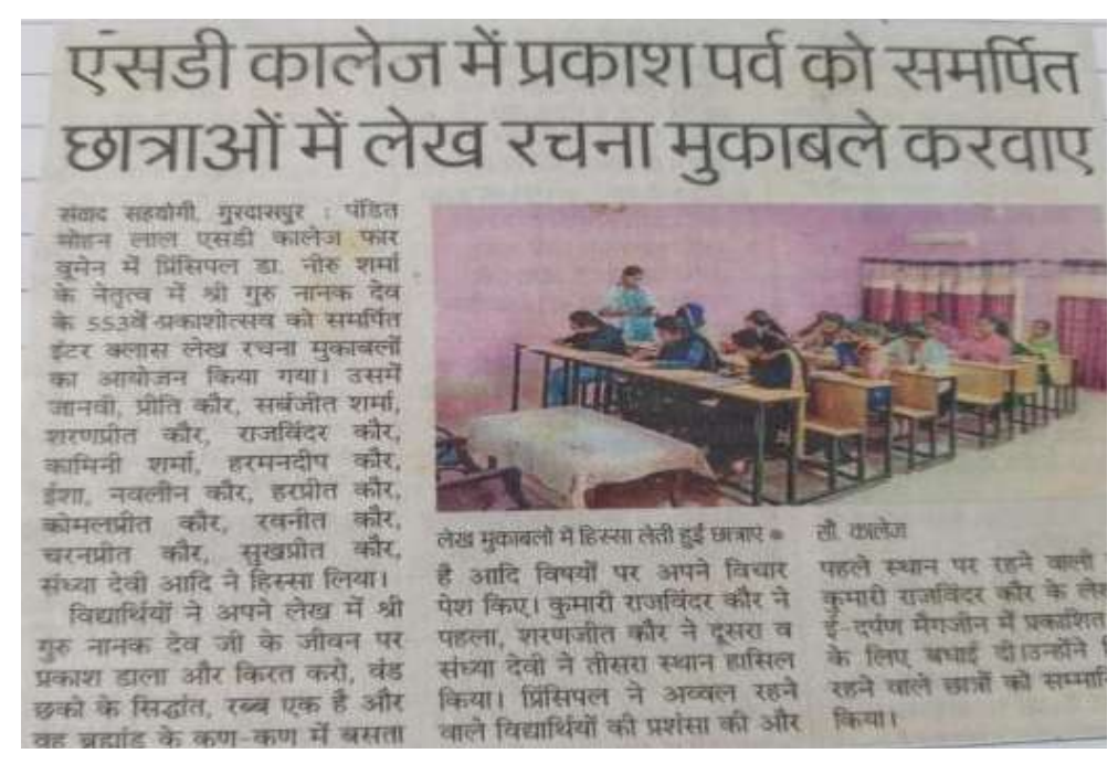
553 Birth anniversary of Guru Nanak Dev Ji

Essay Writing Competition was organized by Punjabi Department to commemorate the 553 Birth anniversary of Guru Nanak Dev Ji in which 19 students of the college participated.