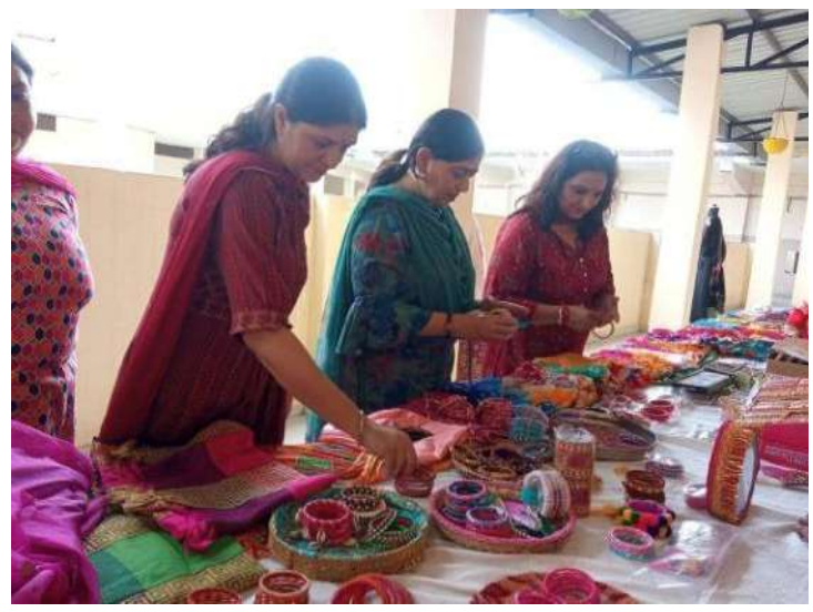
Karwa Chauth festival

The Fashion Designing department of the college organized exhibitions to celebrate the spirit of Karwa Chauth festival and to showcase the talent and entrepreneur skills of the students..