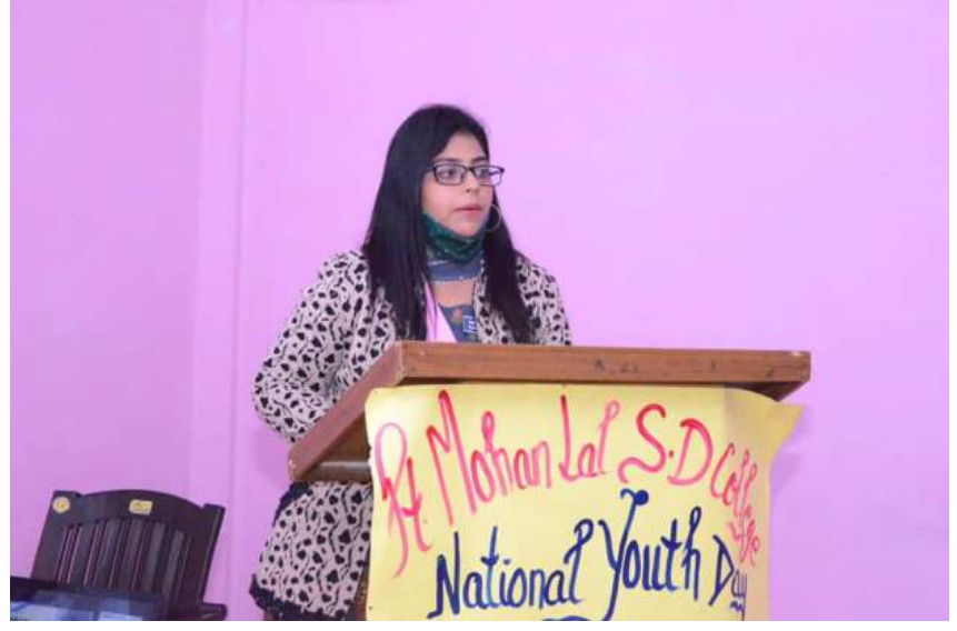
National Youth day

National Youth day was celebrated in the college campus in which a declamation contest was organized on 'Girl Child' and 'Swami Vivekanand Ji'. Students participated with zeal and fervor.