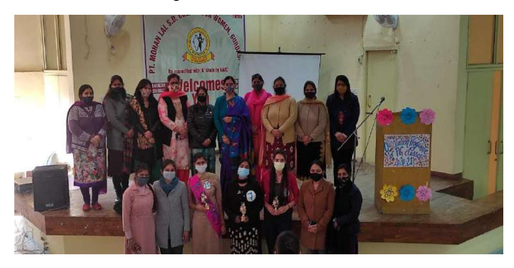
An orientation program for PG classes

An orientation program for PG classes was organized in the college premises. Students of 1st semester of M.Sc.(Comp. Sc), M.Com and M.A Punjabi were welcomed with a tilak ceremony and were acquainted with course curriculum, code of conduct and other important activities by the heads of departments. They were introduced to various clubs and committees of the college.