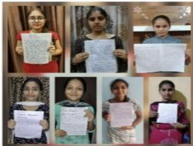
Essay Writing competition on E waste management