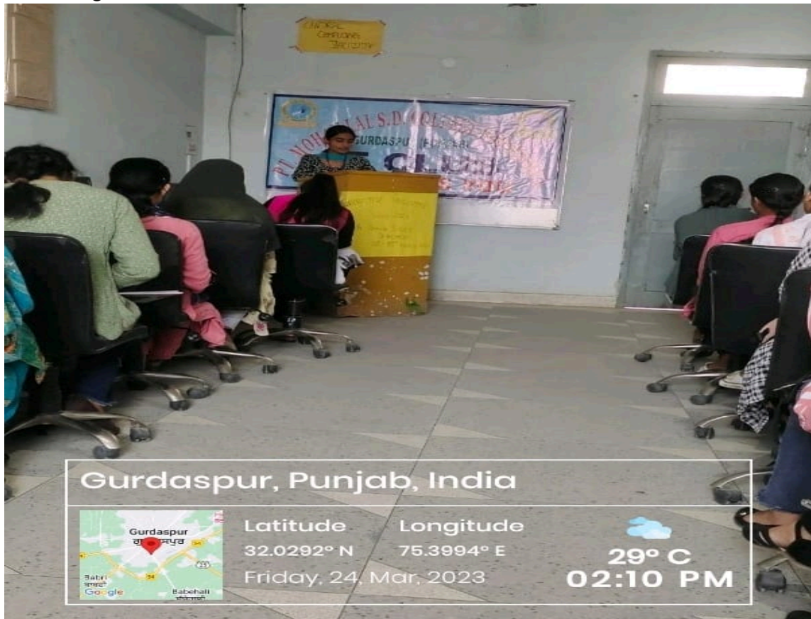
Interactive Programme Week

The week-long event witnessed active participation from students of different semesters, showcasing their talents and skills in various technical domains.