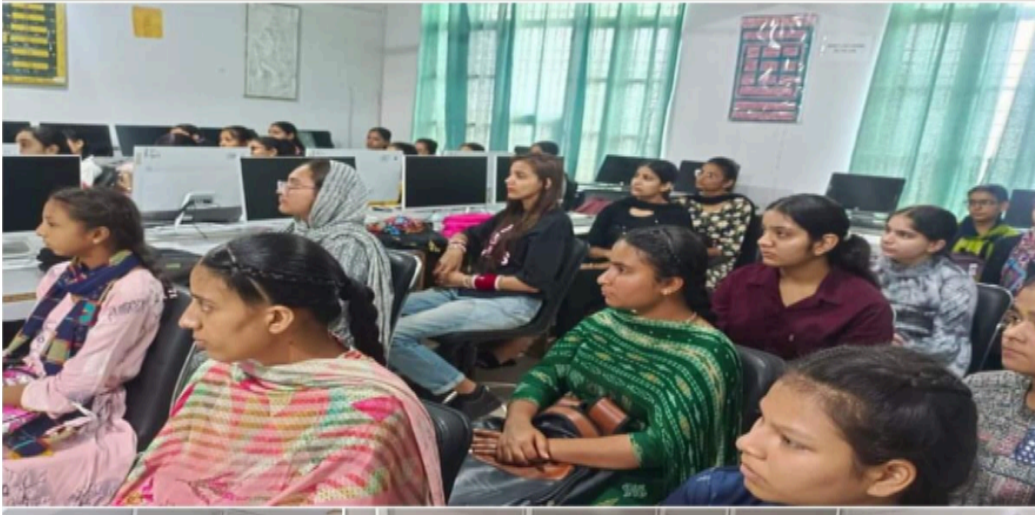
One day workshop on Hardware and Software devices

One day workshop on Hardware and Software devices by Computer Science Department