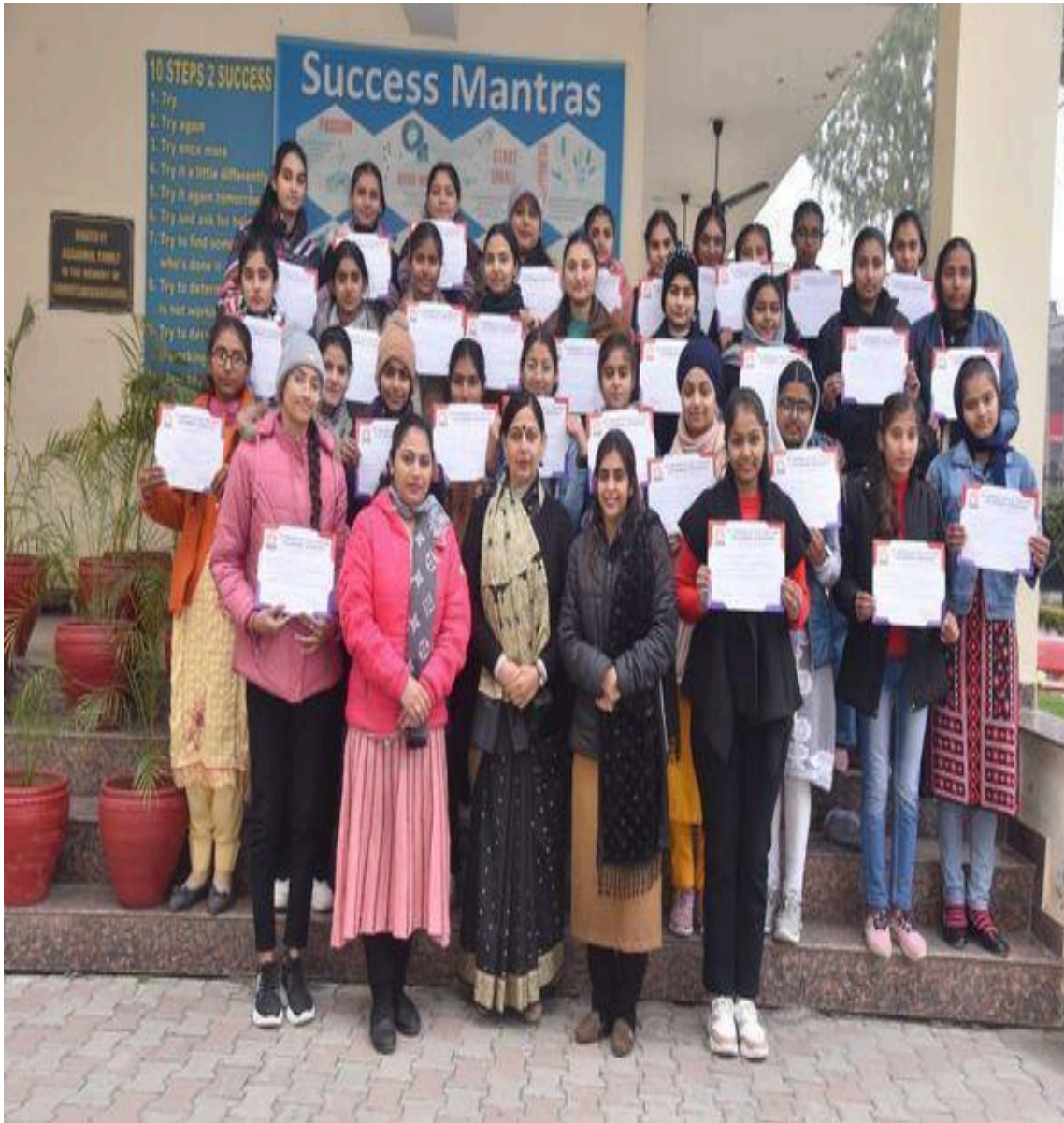
Skill Development Courses on C/C++ and Web Designing.

Keeping in mind the guidelines of NEP, under the realm of IQAC, the Department of Computer Science organized two Skill Development Courses on C/C++ and Web Designing. 50 students were enrolled for these courses from the college. The main purpose of these courses was to develop programming skills among students.