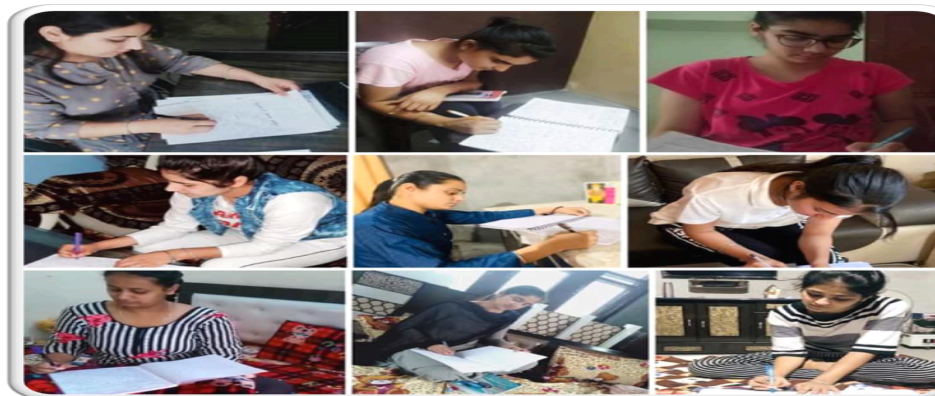
“Online Essay Writing” competition on the topic “How Countries are using Technology to fight CoronaVirus”

The Computer Department organized an Essay Writing Competition during the lockdown period on the topic“ How countries are using technology to fight Coronavirus”, in which students of BCA, B.A.(Comp App), M.Sc participated. The students elaborated their views about usage of robots, drones, CCTVs and various mobile apps available to flight against Covid-19.