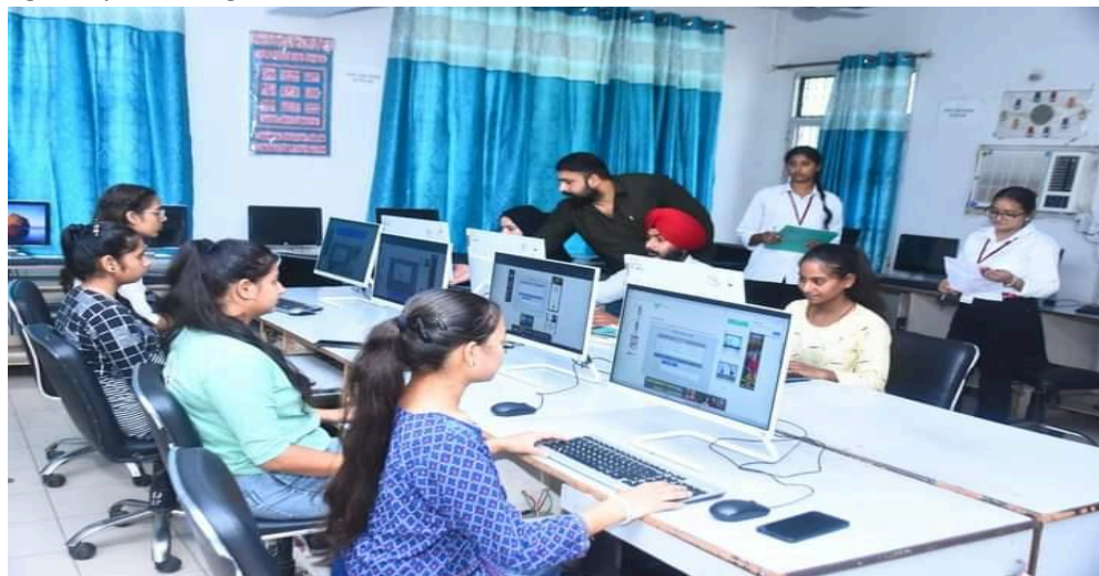
Short term course on Desktop Publishing

Computer Department organized Short term course on Desktop Publishing to enhance knowledge on publishing