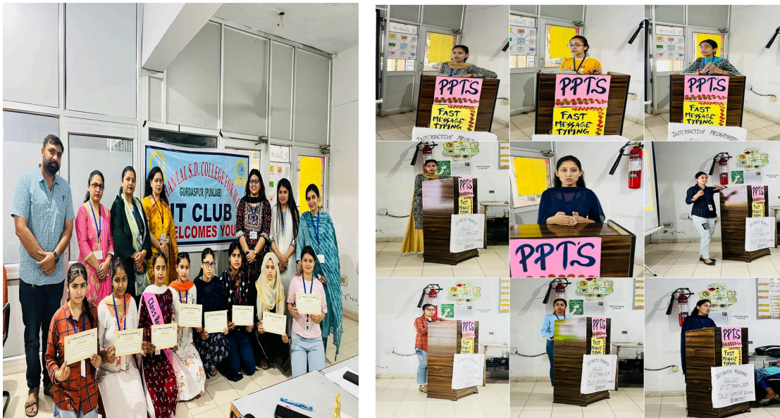
'Interactive Programme Week'