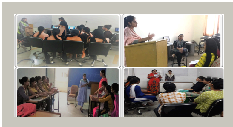
Interactive week on social network sites

An “Interactive Programme Week” was organized by the Computer Science Department in which Quiz, Seminars, Group Discussions, Presentations were organized and students participated in it enthusiastically.