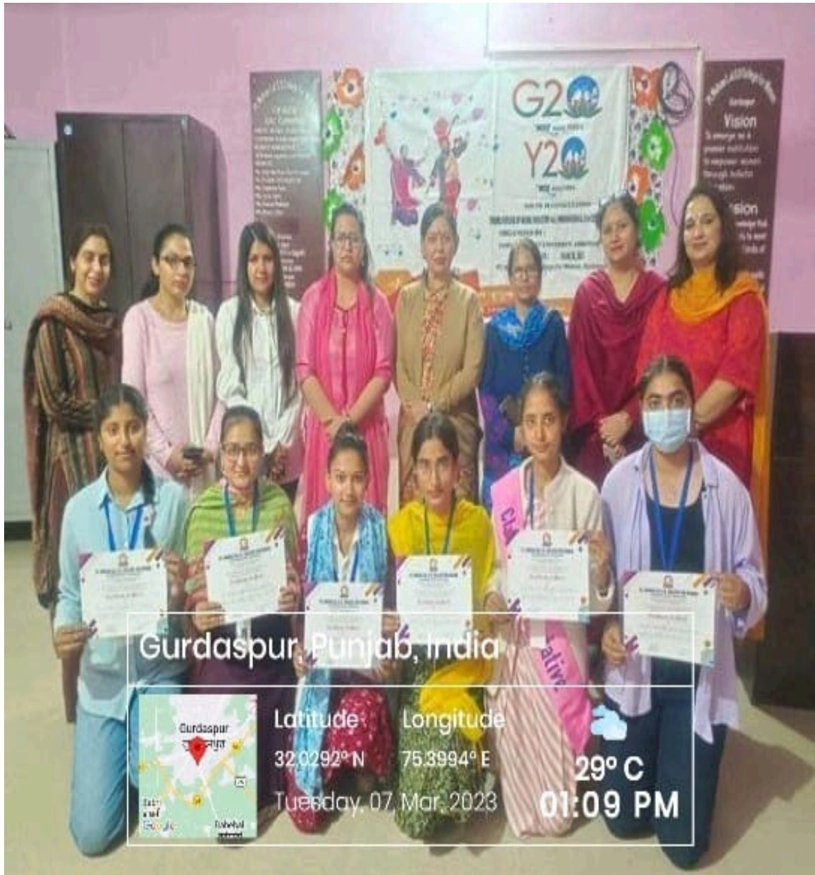
‘Innovation in Technology and Job Security’

The Computer Science dept. organized a quiz competition on theme ‘Innovation in Technology and Job Security’. The aim of the competition was to promote awareness and understanding of the latest developments in the field of technology and their impact on job security. There were four teams.